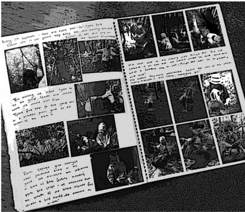
Figure 2. A photo journal.

encouraged the children to look and reflect on the nature around them, however, the degree of enacted environmental practice varied across the sites.